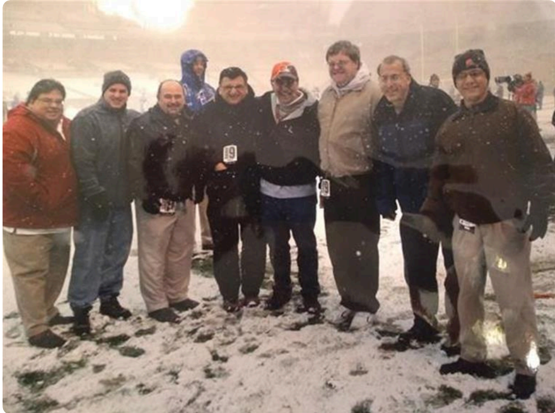
Taken on the field of First Energy Stadium on December 16, 2007